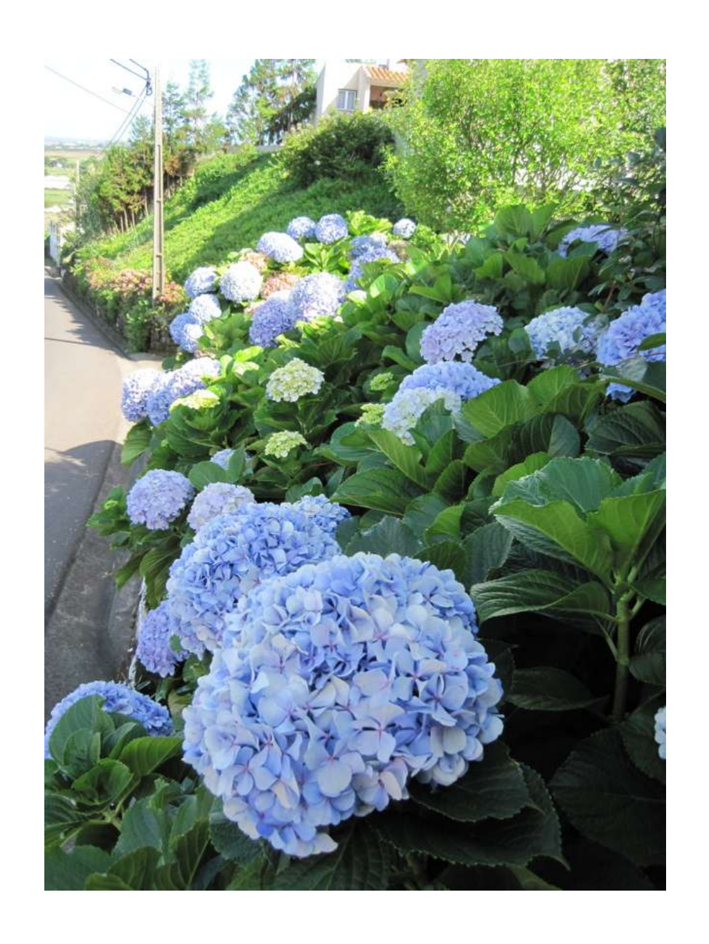
St. George has its great hard cheeses, Pico its black houses made of lava, Faial the most colorful marina in the world, Flores its flowers and unspoiled nature,